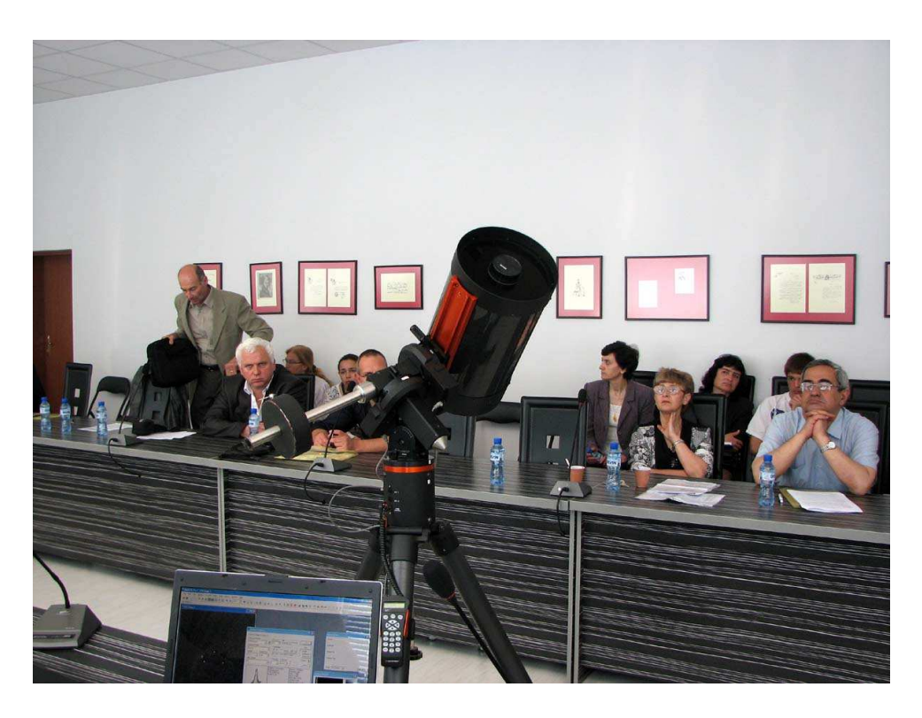
Fig. 3. A robotized small telescope from the beginning of the SMARTNET Project