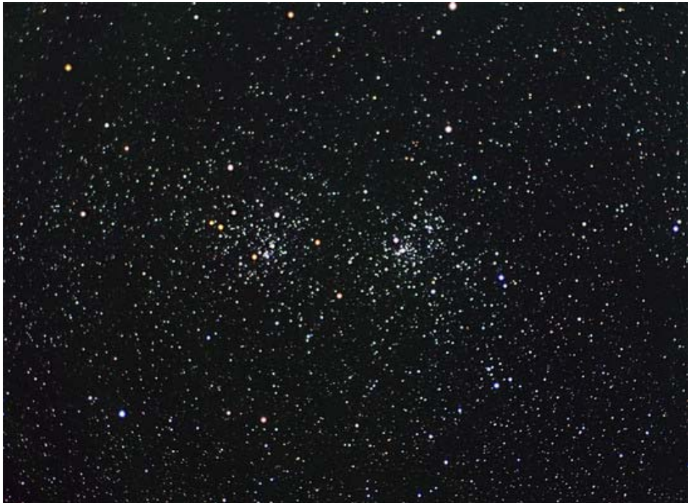
Figure 1. Binary open cluster h and \chi Persei.

While the particle-particle method is the most straight-forward method of the N-body methods, the computational physicist must still think carefully about the numerical details of formulating the theoretical physics of the problem into a digital form, in order to derive results that are physically plausible. For example, as the particles approach each other, the forces between them, and hence the accelerations, become much larger. If one uses a constant time-step in the integration scheme in order to calculate the velocities and positions, then you're likely to encounter computer overflow errors giving nonsense numbers. To avoid this situation, you may want to consider a numerical integration scheme that uses variable time-steps, instead of constant time-steps. Such a scheme should automatically cut down the time-step when the particles are near each other, and increase the time-step when the particles are far away from each other.